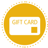
SHOPPING & ENTERTAINMENT*

Change the conversation with your clients — make it about living life to the fullest. To learn more, please go to JHredefininglife.com .