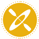
HEALTHY GEAR DISCOUNTS*