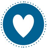
FREE HEALTH CHECK