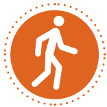
FREE FITBIT DEVICE