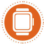
WEARABLE DEVICE DISCOUNTS