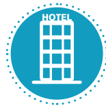
HALF-PRICE HOTEL STAYS*